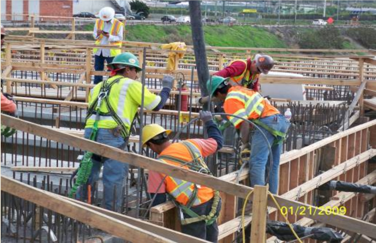
Concrete Placement for End Diaphragms at National Boulevard Bridge