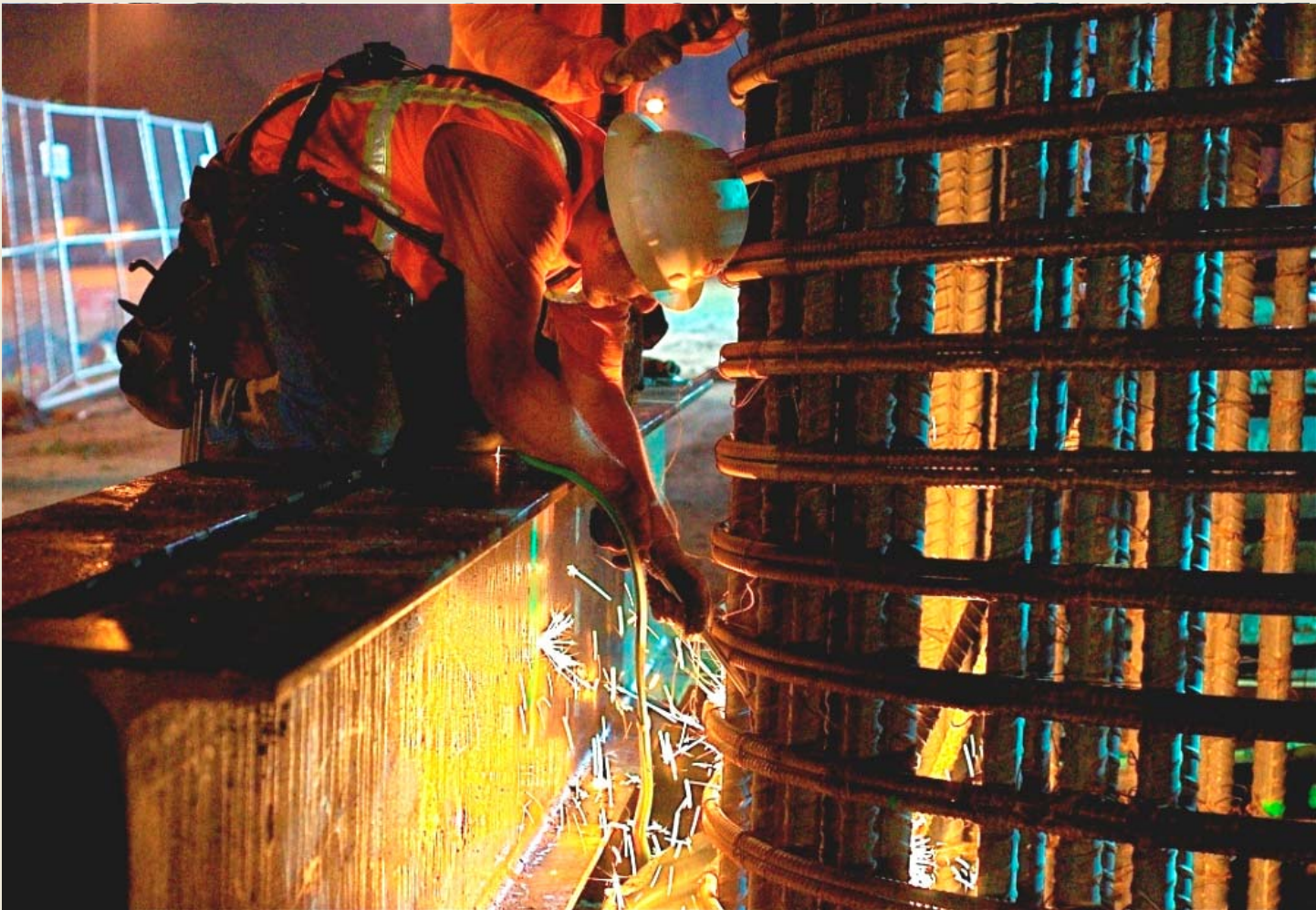
Completing the 11' CIDH piles for La Cienega overcrossing