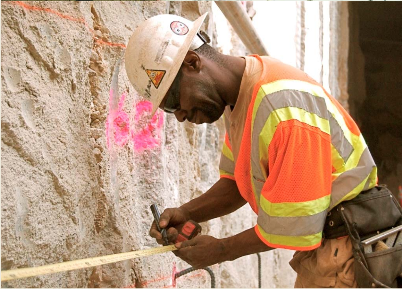
Preparation for drilling of dowels at A3 Trench walls