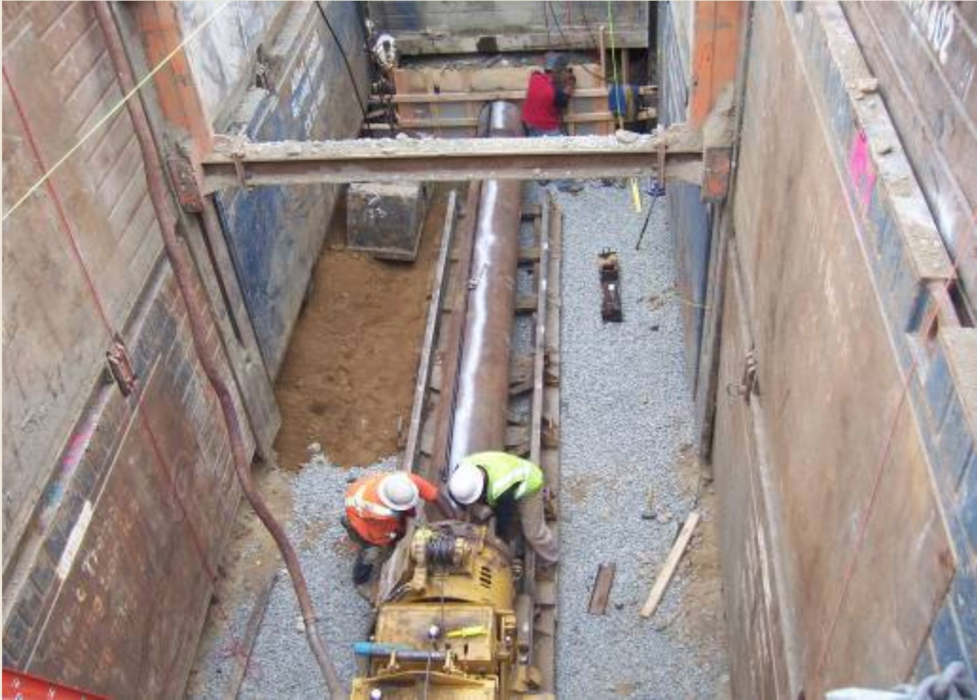
Boring for Ductbank Conduits at Arlington Ave. and Exposition Blvd.