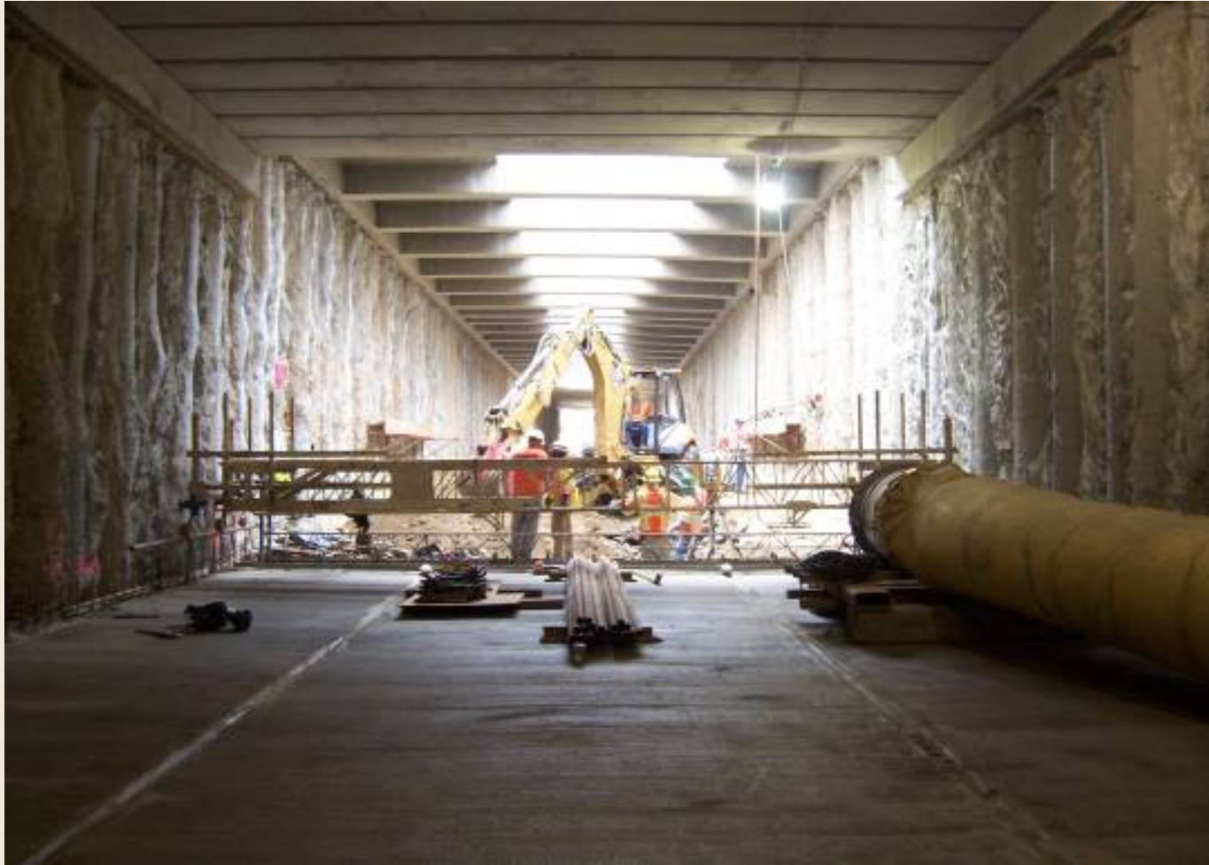
Sub-grade Preparation in Support of Invert Slab Placement at Grade Separation Trench Structure